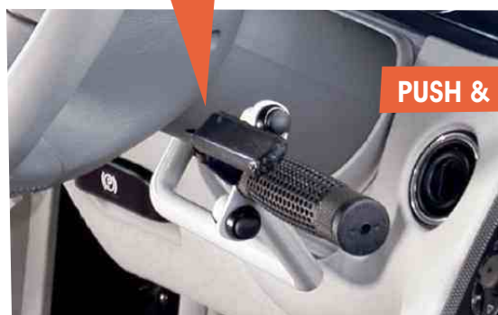
PUSH & PULL